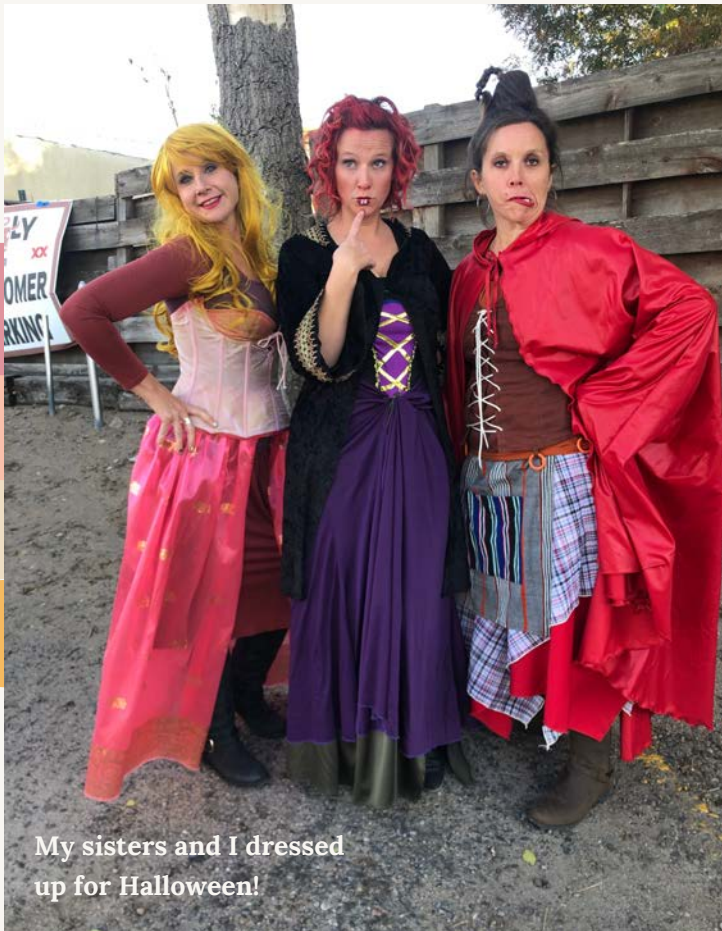
My sisters and I dressed up for Halloween!