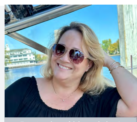
Enjoying a beautiful day on the boat!