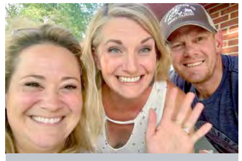
Visiting friends in Colorado

with an international community service and performing arts organization. This was an incredible opportunity to see the world, live with host families, and make a positive impact in the places we visited.