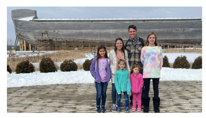
Ark Encounter | Williamstown, Kentucky