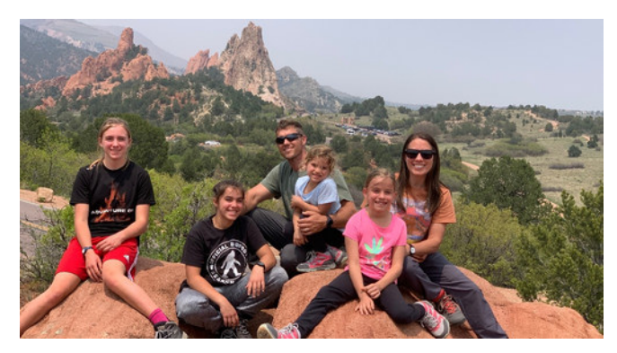
Garden of the Gods | Colorado Springs, Colorado