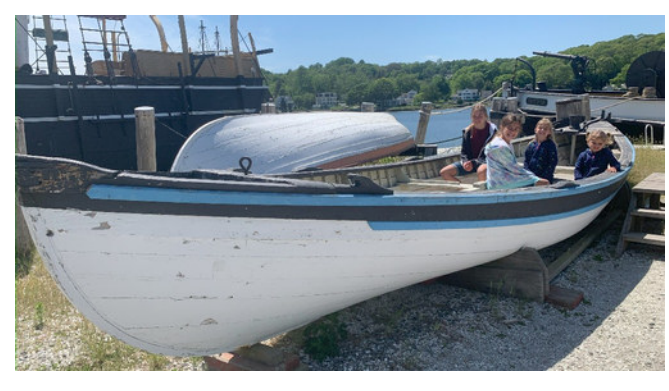
Mystic Seaport Museum | Mystic, Connecticut