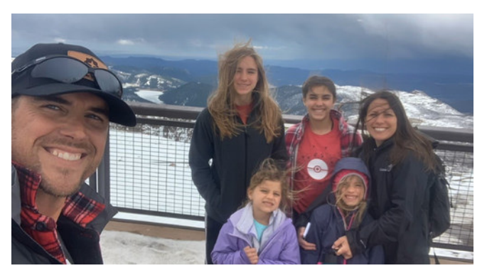
Pike's Peak | Colorado Springs, Colorado