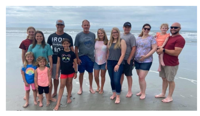
Myrtle Beach, South Carolina