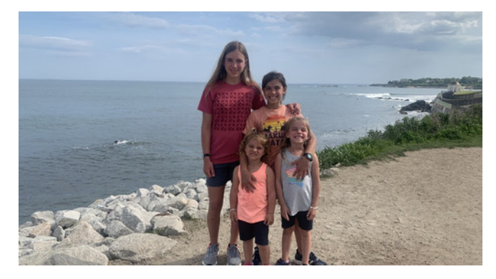
Cliff Walks | Newport, Rhode Island