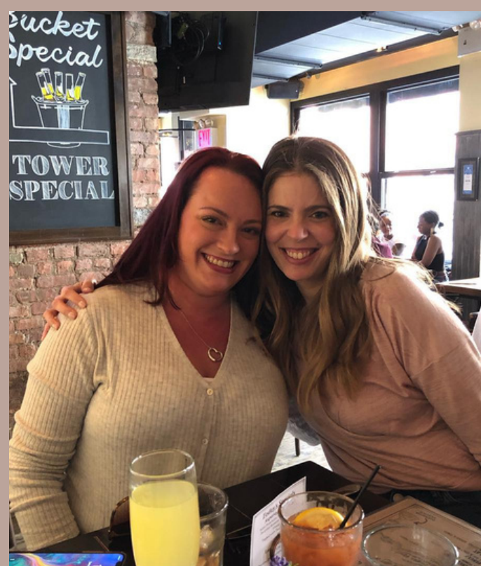
"There is no one with bigger hearts or more open minds than this couple"