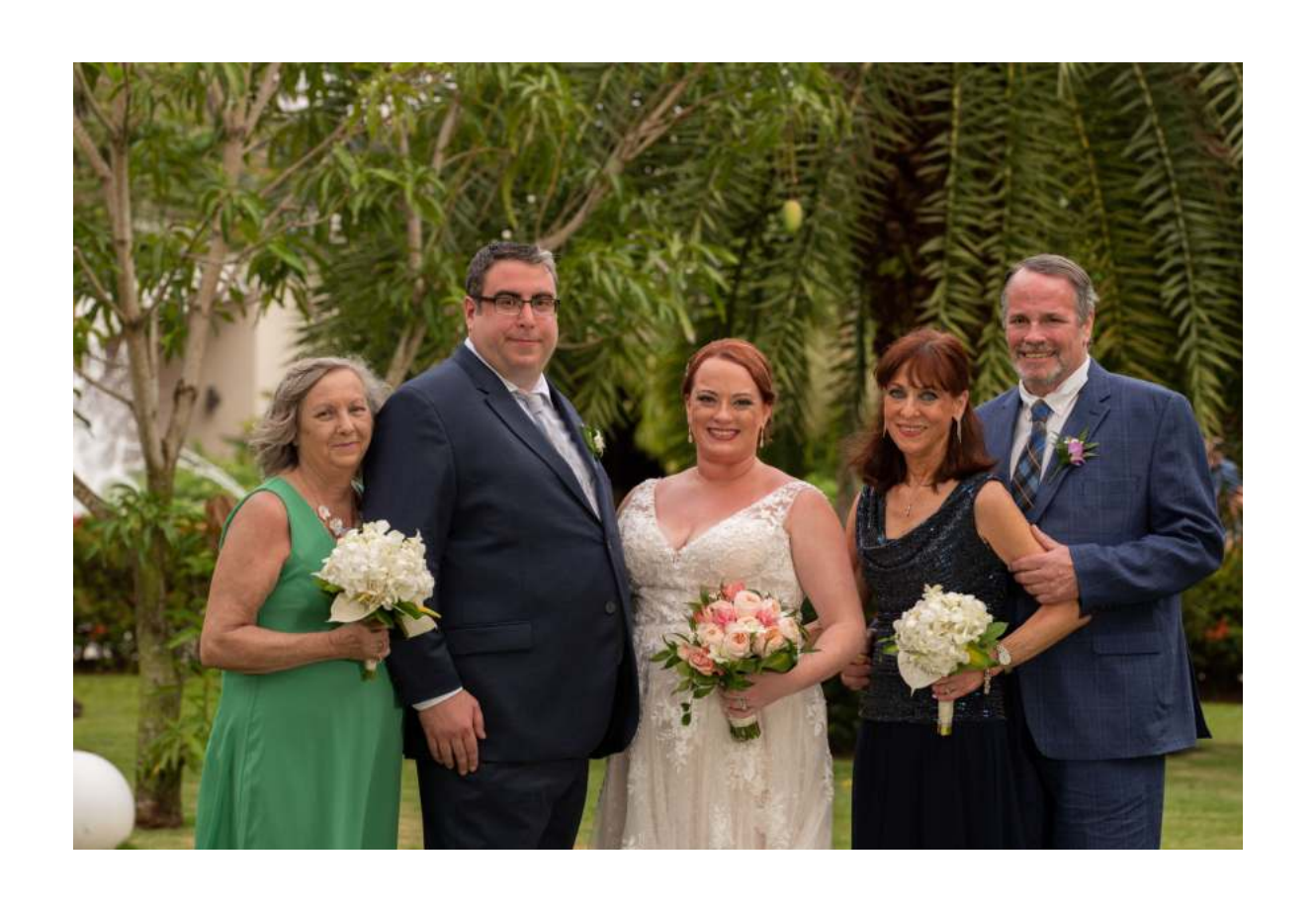
"Any lucky child would feel as if they hit "The Best Family Jackpot"