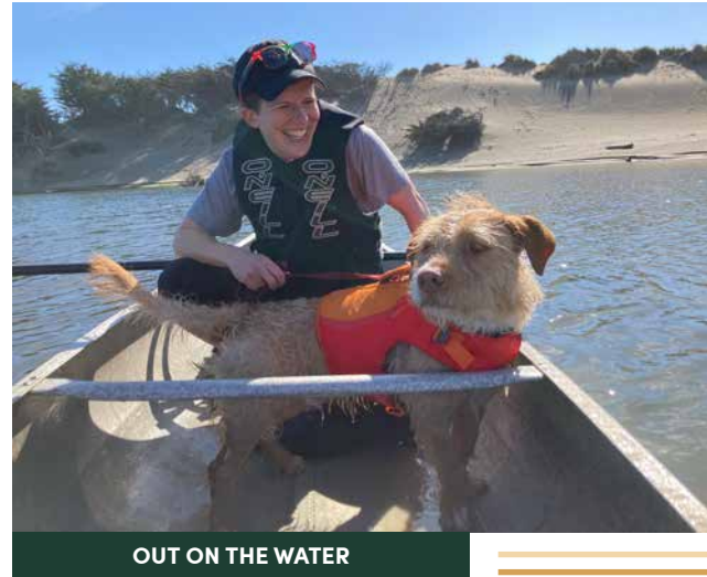
OUT ON THE WATER

They do not shy away from solidarity with all types of people and situations. Their boldness (right down to their pronouns) is a sign of thoughtful protest and hope for a better world. They will teach our child to embrace their uniqueness proudly and to always fight for what they believe in.