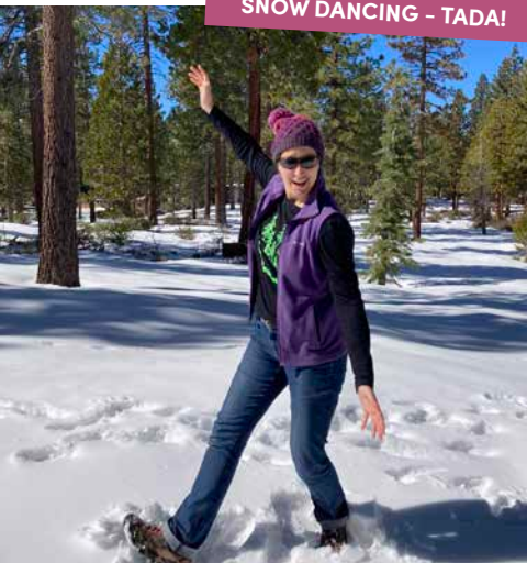
SNOW DANCING - TADA!