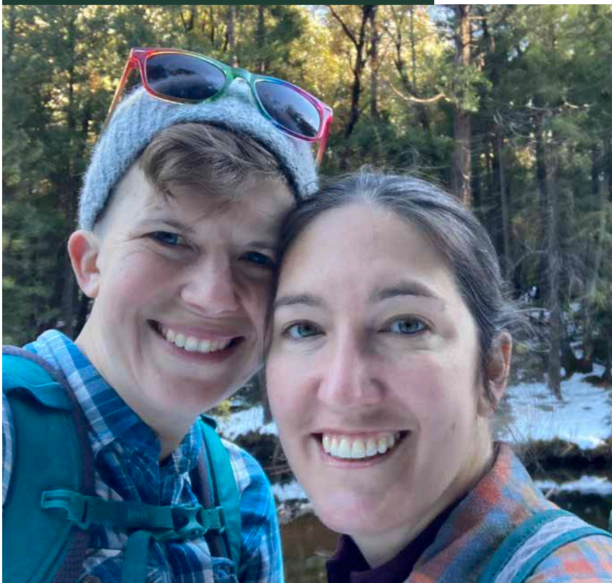
ENJOYING HIKES TOGETHER SINCE DAY ONE

We think we're pretty down-to- earth and easy to talk with. We hope we get the chance to get to know you!