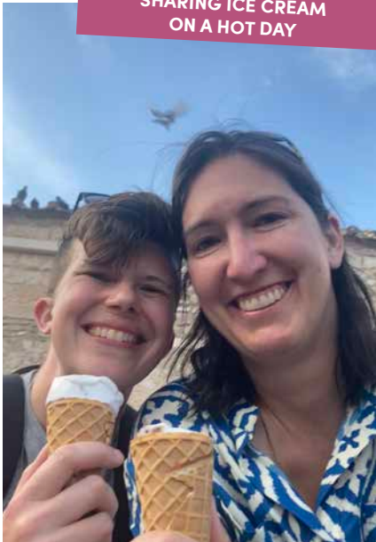
SHARING ICE CREAM ON A HOT DAY