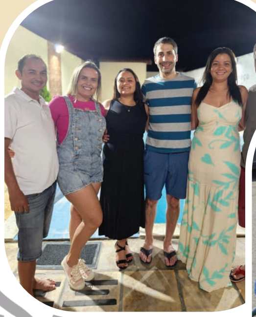
Visiting with friends in Brazil