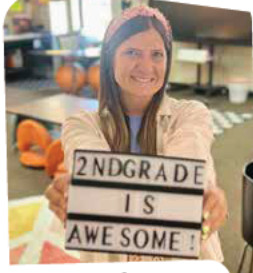
Scout loves teaching the littles