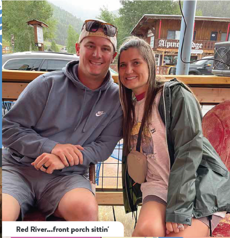
Red River...front porch sittin'