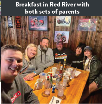
Breakfast in Red River with both sets of parents