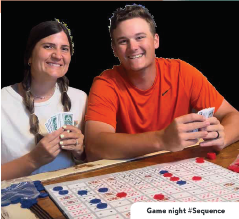
Game night #Sequence