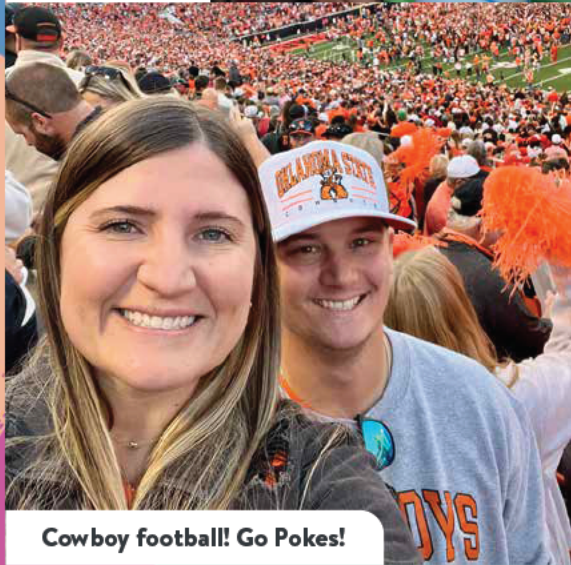
Cowboy football! Go Pokes!